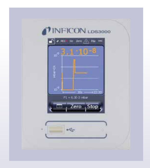
CU1000 OPTIONAL TOUCHSCREEN DISPLAY