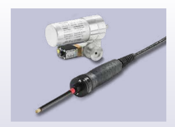
CALIBRATED STANDARD TEST LEAK TL7 AND SNIFFER LINE UP TO 10 M